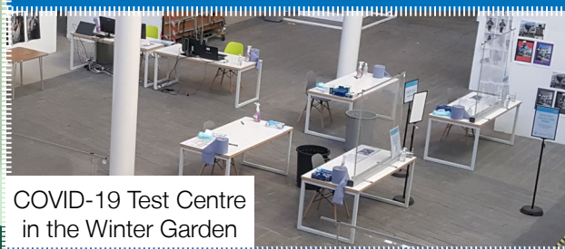
COVID-19 Test Centre in the Winter Garden

A lot has been happening in the last few weeks at East Surrey College. We have introduced a COVID-19 test centre in the Winter Garden for students and staff who are required to be onsite. Testing is optional however we are encouraging students to take the tests to help you protect your classmates, staff, family and community whilst supporting the national effort. The tests are self-administered lateral flow tests which is a fast and simple way to test people who do not have symptoms of COVID-19, but who may still be spreading the virus. All tests are booked in advance and require consent. Along with social distancing, guidance will be provided on how to take the test. Once more people are allowed to return to College then details of the online booking system will be circulated (please do not visit the College unless you are already scheduled to attend and have permission to do so). We'll keep you updated on any changes but feel free to ask your tutor if you have any questions.